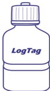
Glycol Buffer Not Included