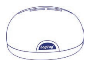
LTI-HID Not Included