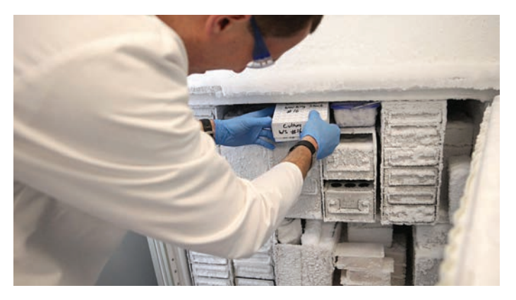
Vaccine & Pharmaceuticals