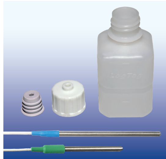
Glycol buffer (seal, cap and vial) with ST100K & ST10M sensor

The buffer is used with LogTag's ST100K-15 or ST100K-30 sensors connected to any TRED30-16R, UTRED/UTRED30 or TRES-8 temperature loggers and approx. 57ml (1.9 fl oz) of glycol. The buffer is also used with LogTag's ST10M-15 sensor connected to any TREL/TREL30 and UTREL/UTREL30 loggers. These items are not part of the kit and need to be ordered separately.