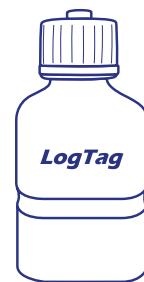
Glycol Buffer Not Included