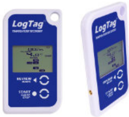
This quickstart guide covers preparation of the LogTag for the following preparation TRID30-7 and TRED30-7